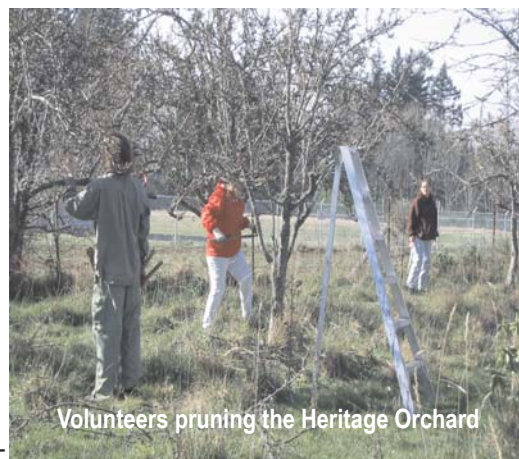
Volunteers pruning the Heritage Orchard

Check the website at http://www.haliburtonfarm.org for details on the planned activities of our upcoming work parties.