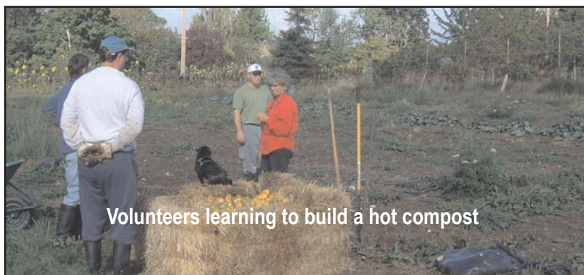
Volunteers learning to build a hot compost