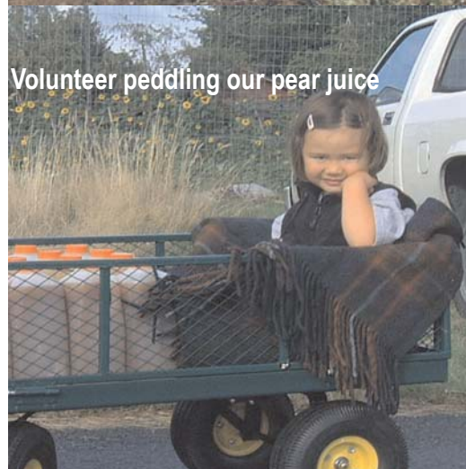
Volunteer peddling our pear juice