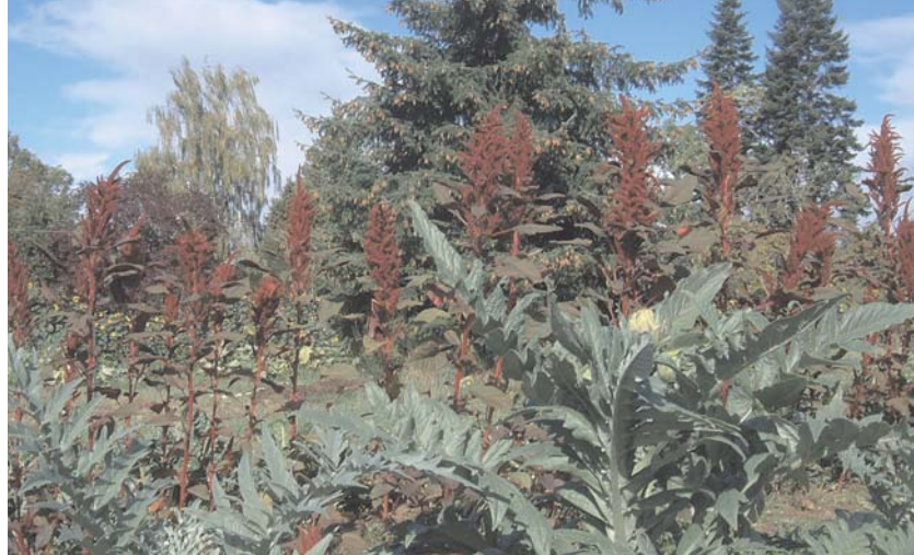
Amaranth and globe artichokes growing at Haliburton last season

So, next time you're at the Soap Exchange, don't forget to mention Haliburton!